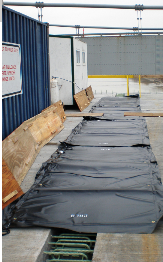
Powerblanket standard concrete blanket on the top of the project.

Standard curing blankets could help heat the top surface of the poured concrete, but they could not adequately heat the entire 12-inch